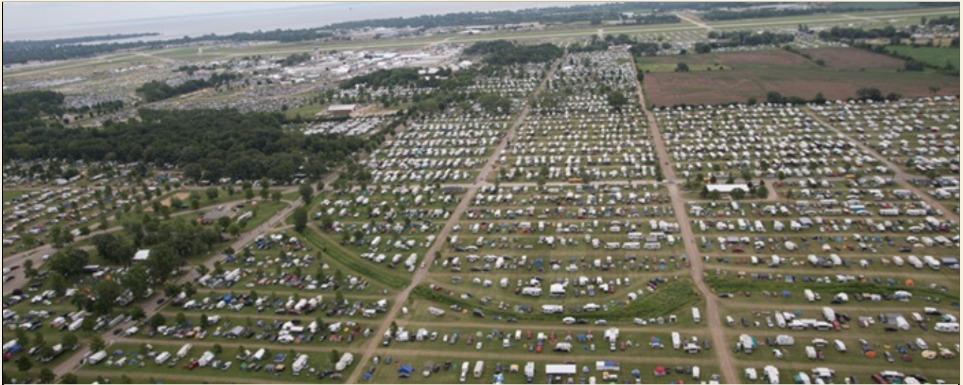
EAA AirVenture Oshkosh's Camp Scholler opens Friday, June 27.

June 25, 2014 - Early AirVenture arrivers are expected to be lined up and ready to stake their claim the morning of Friday, June 27, as registration for Camp Scholler opens for EAA AirVenture Oshkosh 2014 – just over a month before opening day.